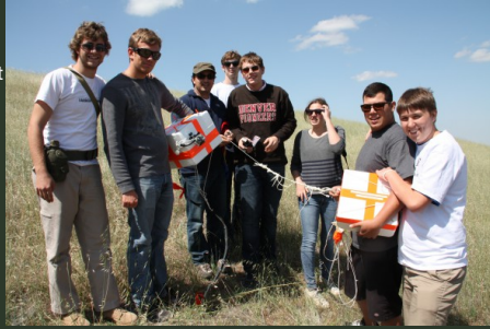
AAHAB-2 was recovered from a ranch near Bakersfield four and a half hours after launch.